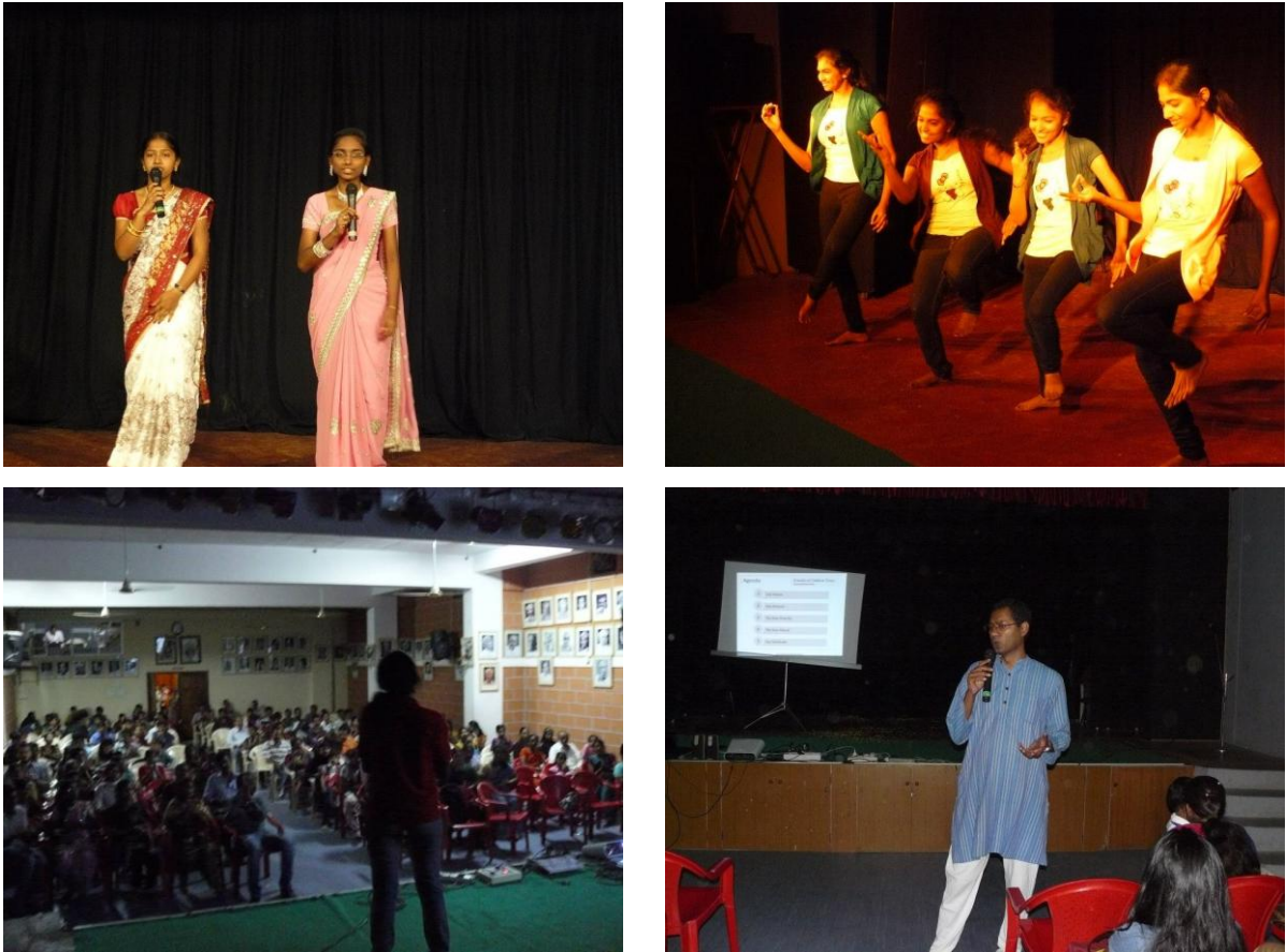
Figure 2: Annual Day Pictures