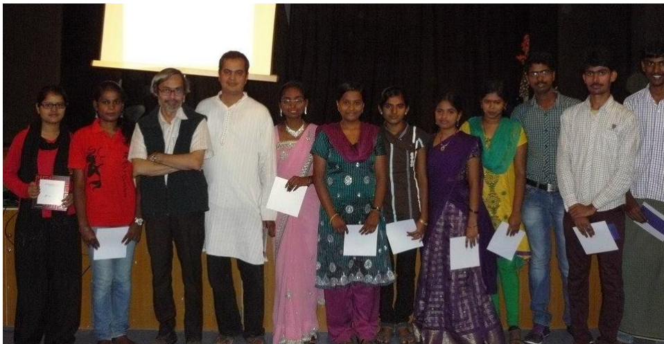
Figure 1: Quiz finalists with Quiz master

It was heartening to see the increase in interest among the students over the years. This year we had a few students actually making note of the questions and answers. Almost all of the audience questions were also answered.